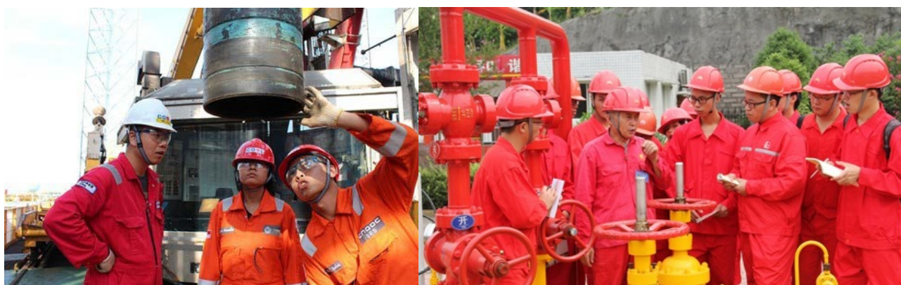
Figure 2: On-site drilling practice.