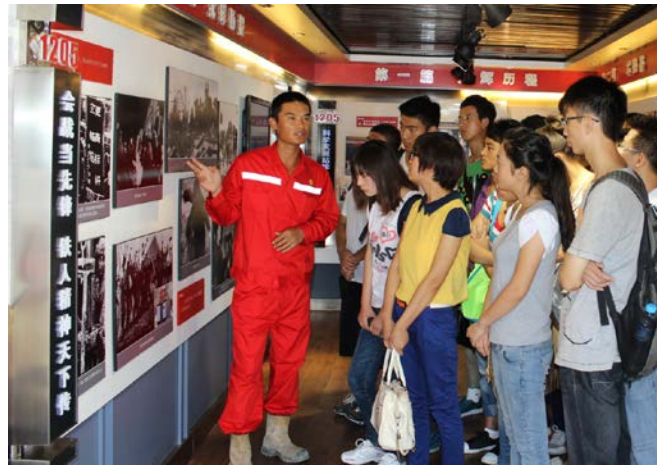
Figure 3: Visiting history museum of Iron 1205 drilling crew.

such as Iron 1205 , Sharp Knife 1202 drilling crew, Heroic-Workover Iron Army team 107, and so on. These gold-medal teams have excellent skills and strict disciplines, and they have their own team history exhibitions, which serve as an outstanding cultural heritage base of the spirit of Daqing and the iron man culture. A visit to the museums and the gold-medal team exhibitions as a part of the learning process provides students with a better understanding of the Daqing spirit and the Iron Man spirit, encouraging students to embrace these spirits as shown in Figure 3.